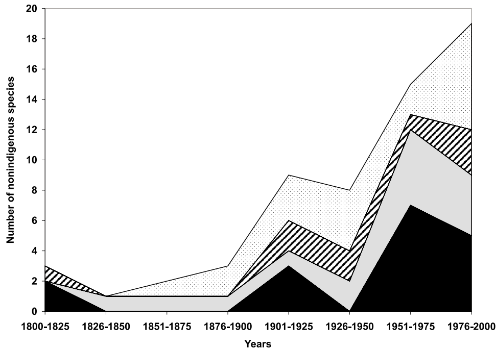
Fig. 2. Number of new nonindigenous species recorded in the Baltic Sea during quarter-century intervals since 1800 according to their area of origin: Ponto-Caspian (black); North America (shaded); South East Asia and Indo-Pacific (hatched); other regions or unknown (stippled).

and Mecke (1996), and others. The Baltic Sea and especially its coastal inlets and lagoons are heavily infested with nonindigenous species (Gruszka 1999; Leppäkoski and Olenin 2000a, 2000b; Figs. 1, 2). By the beginning of 2001, 100 nonindigenous species had been recorded in the basin, although fewer than 70 have established reproducing populations. Of the approximately 60 unintentional introductions (including nonestablished species) with more or less known dispersal histories, 38 are transoceanic (among them, 19 are of trans-Atlantic, i.e., North American, origin), and a further 18 are native to the Ponto-Caspian region (Baltic Sea Alien Species Database 2001).