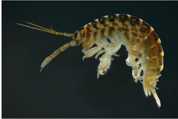
Figure 2. Live specimen of Dikerogammarus villosus.