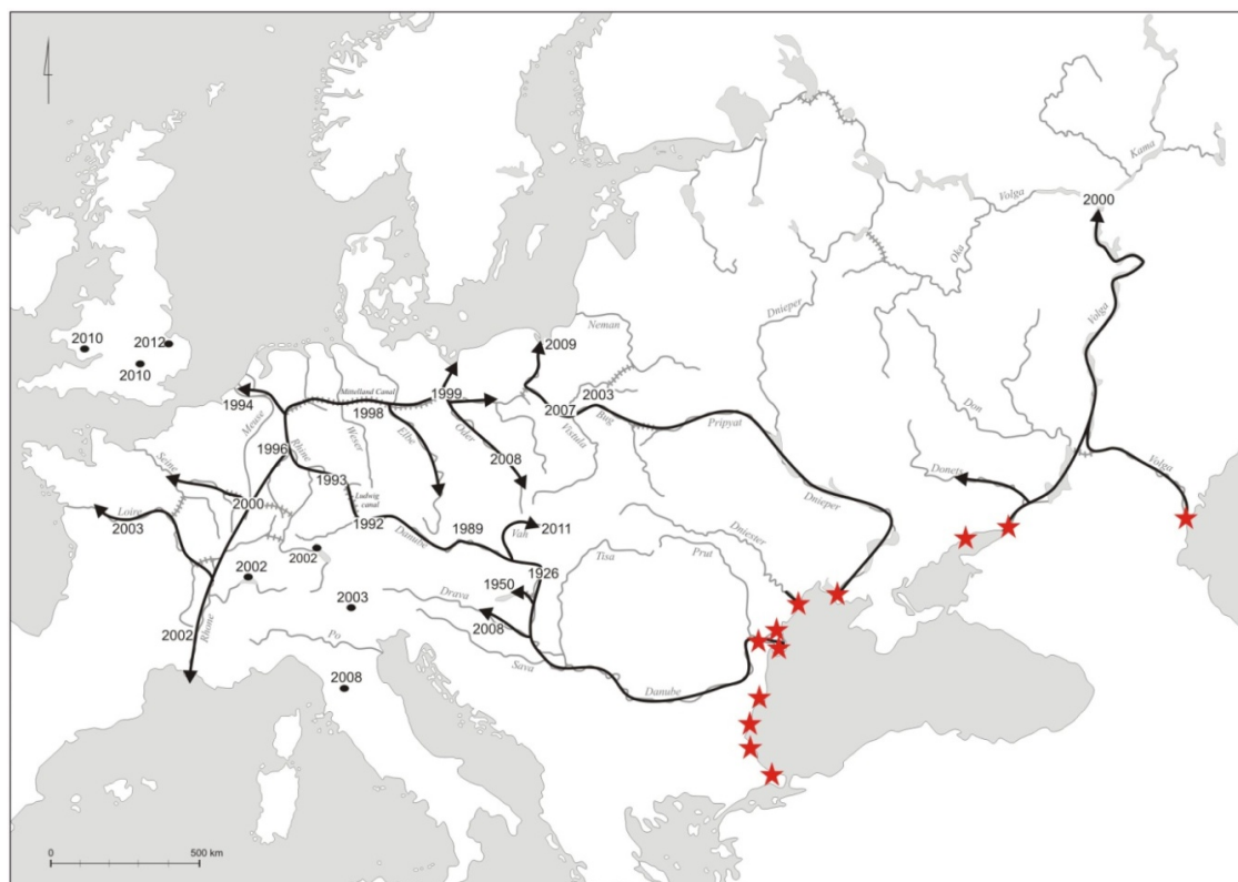
Figure 3. Invasion history and routes of Dikerogammarus villosus spread in Europe. Dates indicate the first record in the particular section of the invasion route (citations in the text). Red stars indicate known localities within the native range (for details see Supplementary material - Tables S1 and S2).