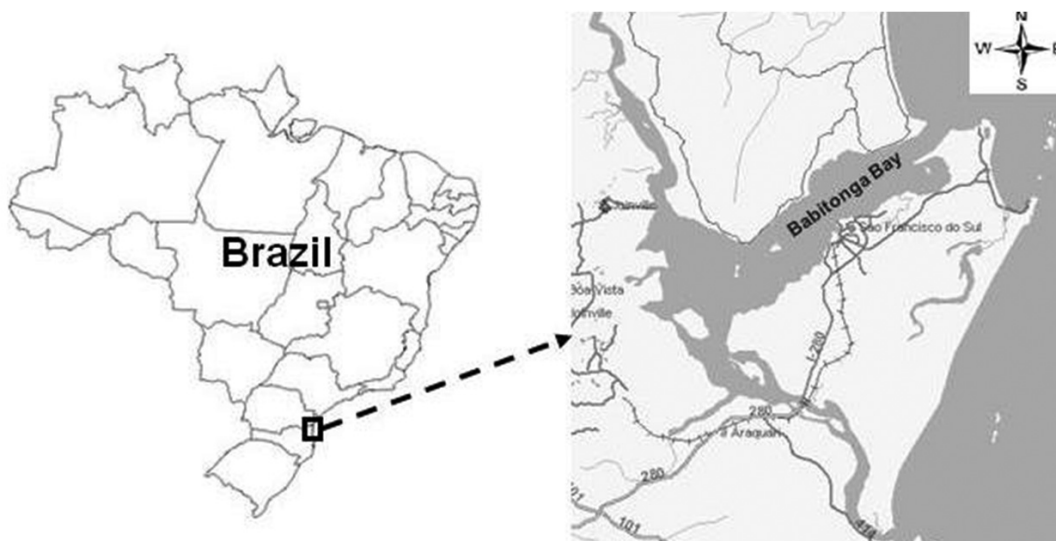
Figure 1. Babitonga Bay, Santa Catarina state, south of Brazil.

The anthropogenic pressure and the presence of exotic species such as O. punctatus , strengthen the need for the implementation of an effective monitoring program in the port and adjacent areas of Babitonga Bay. For this reason, this study aimed to evaluate the occurrence and distribution of O. punctatus larvae in Babitonga Bay (south coast of Brazil).