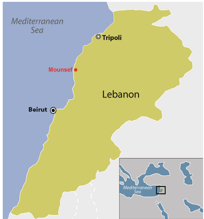
Figure 1. Map showing the collection site of the specimen.