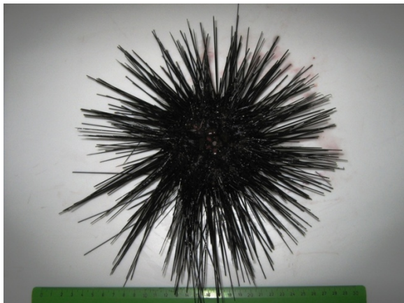
Figure 2. Adult specimen of Diadema setosum (Ruler: 30 cm).