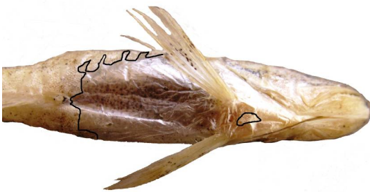
Figure 2. Ventral view Champsodon nudivittis (TAU P- 14329). The line delimits the scaled from the naked area (Photo: Oz Rittner).