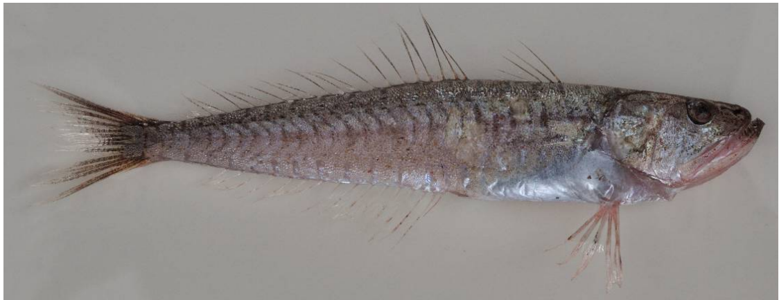
Figure 1. Champsodon nudivittis (TAU P- 14329, SL 89mm) collected off Ashdod, Israel.