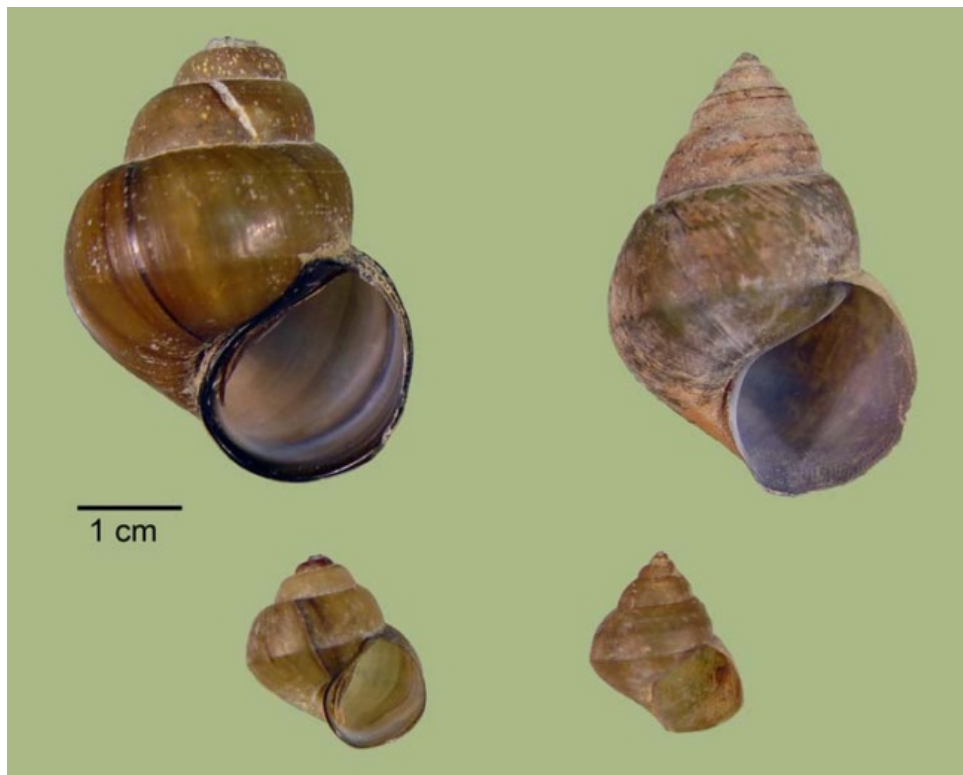
Figure 2. Bellamyia chinensis (left) and B. japonica (right) adult and juvenile shells.