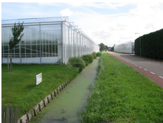
Figure 5. The location of Bellamya chinensis in the village of 's-Gravenzande.