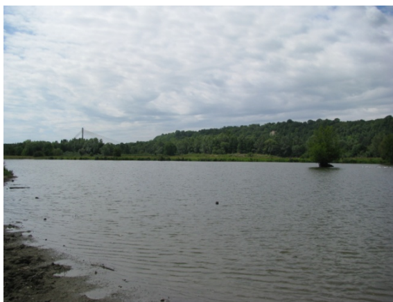
Figure 4. The Eijsder Beemden location.