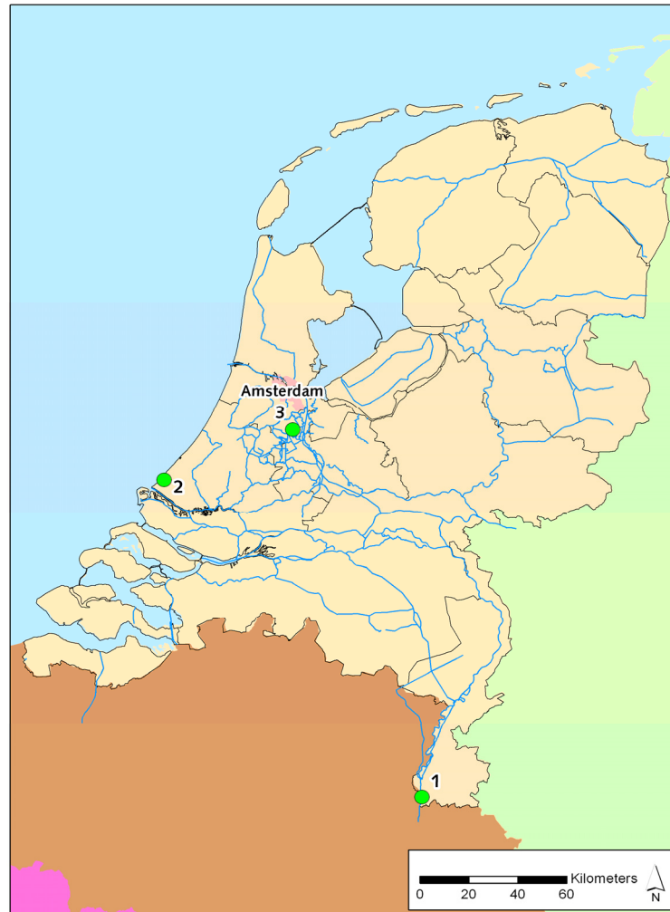
Figure 3. Distribution map of Bellamy chinensis in the Netherlands. 1 = Eijsder Beemden, 2 = 's-Gravenzande, 3 = Vinkeveen.