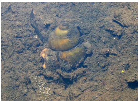
Figure 6. A half buried Bellamya chinensis feeding on detritus in the substrate.

The first reports of B. chinensis from the USA are from the early 1890s and came from San Francisco, where live specimens, imported from Japan, were for sale in a Chinese market (Wood 1892). B. chinensis is commonly consumed in Asia, which probably promoted its subsequent spread to North America. B. chinensis is also known to be popular in the North American aquarium and ornamental trade and associated activities are expected to be an important source of new populations (Karatayev et al. 2009). The way of entry into the Netherlands is probably also related to pet trade for garden ponds or aquaria. In Europe this species is still rare in trade, but it has actually been traded in the Netherlands and was found in a garden pond in 2008 (D.M. Soes, pers. obser.). The location near the village of Vinkeveen is remarkable because of the co-occurrence of Orconectes virilis (Hagen, 1870), an invasive North American crayfish. The first records of this species in 2004 are from the Vinkeveen area, also suggesting that both species have a common origin here (Soes and Koese 2010).