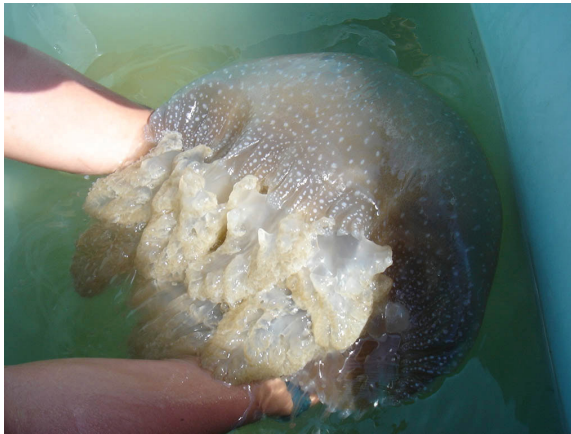
Figure 3. Adult of Phyllorhiza punctata , Laguna de Mandinga, Veracruz. Southern Gulf of Mexico. June 2006.