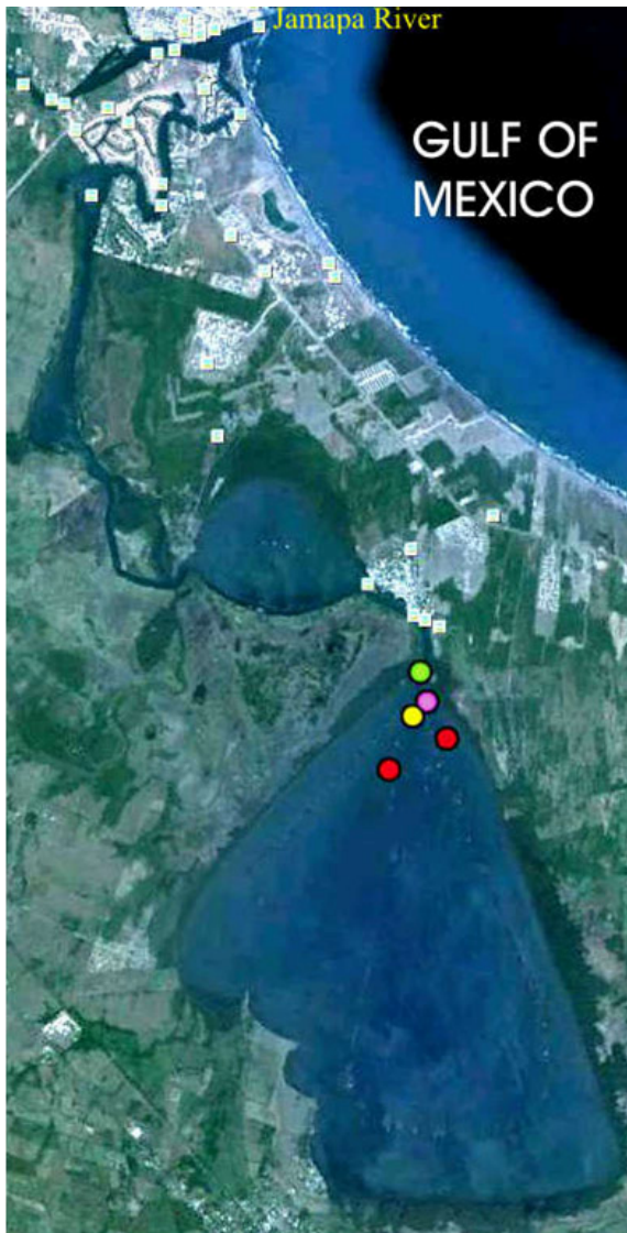
Figure 1. Laguna de Mandinga, Veracruz, Mexico, with all locations where Phyllorhiza punctata was collected: June 2006 (pink dot), May 2007 (yellow dot), June 2008 (red dots) and May 2009 (green dot).