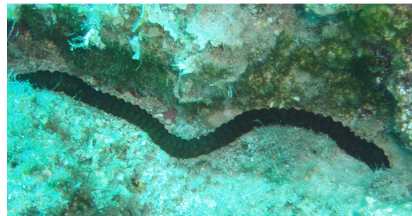
Figure 1. Synaptula reciprocans , Tilos Island, Dodecanese, South Aegean Sea (photo by C. Antoniadou, 27 September 2005)

Antikeros islands (Figure 2). S. reciprocans was found on sandy bottoms with gravel and pebbles, as well as on gently sloping rocky shores mostly covered with the alga Caulerpa racemosa (Forsskål) J. Agardh 1873. The population density ranged from 0.1 to 0.6 individuals/m 2 , with the highest values recorded at the depth of 4-8 m.