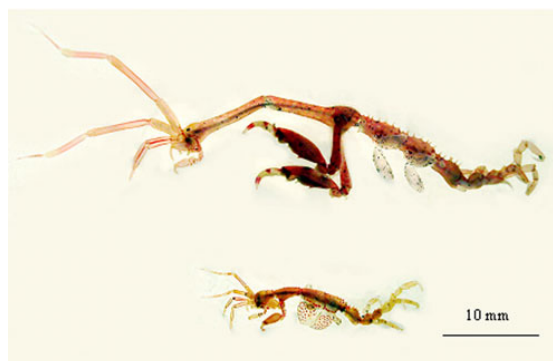
Figure 1. Male (top) and female (bottom) Caprella mutica

Carlton (1979) suggested that C. mutica arrived on the Pacific and Atlantic coasts of North America either as a result of numerous independent cross-oceanic introductions with oyster spat, or from small scale transport following its first introduction (Carlton 1996). Direct sequencing of mitochondrial DNA indicates that C. mutica was introduced to Europe either directly from Asia or from the Atlantic coast of North America (Ashton 2006). Opportunities for the spread of non-native species to Europe across the Atlantic have existed for more than 500 years with early exploration and the subsequent establishment of shipping routes (Stoner et al. 2002). For a little more than a century ships' ballast water has transmitted many different crustacean taxa, including caprellids (Coutts et al. 2003) and in the last half-century ocean barges and oil platforms (or similar structures) have been moved across oceans (Rodríguez and Suárez 2001, Ruiz and Hewitt 2002) and may have introduced C. mutica to Europe. The importation of different species of half-grown oysters as deck