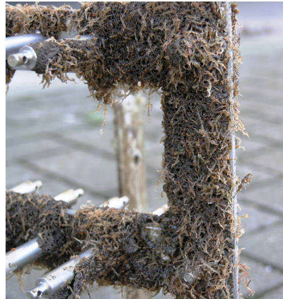
Figure 3. Experimental frame deployed west of Zeebrugge, Belgium in 2007 showing dense aggregations of Caprella mutica after 12 weeks immersion

The abundance of C. mutica on artificial substrata would indicate that conditions on such structures are in some way particularly suited for