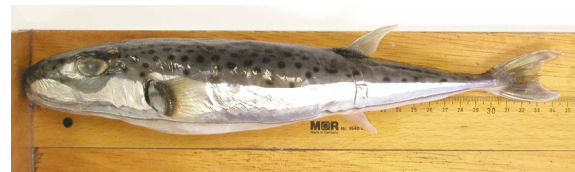
Figure 2. The Lagocephalus sceleratus specimen caught in Heraklion Bay, Cretan Sea in July 2005

Another specimen of L. sceleratus was caught in trammel nets by a fisherman, in a depth of 30 m, in Georgioupolis Bay, Chania (Cretan Sea) (35°21'N, 24°21'E), in December 2005. The catch was reported to HCMR and the identification of the species was done by the photos provided. The specimen was large (>30 cm) and carried the characteristic black, regularly distributed spots of equal size on its back. These accidental catches, within a time frame of six months, indicate that the species has established populations around the continental shelf of Crete.