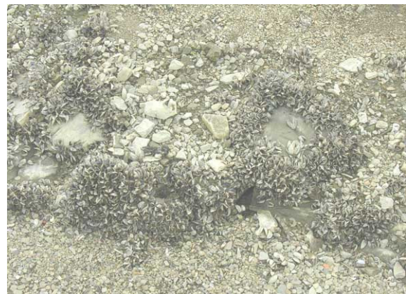
Figure 2. Clusters of Dreissena polymorpha on the shore of Lake Bilancino, exposed because of low water level

This new settlement of zebra mussel is highly significant as it provides a second record for the Tyrrhenian drainage. It is possible to suppose that the route of D. polymorpha invasion will initially follow the course of the River Sieve, which drains from Lake Bilancino, and subsequently reach the Arno after its confluence