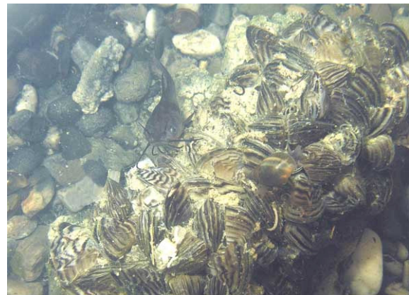
Figure 3. Three non-indigenous species from Lake Bilancino: Dreissena polymorpha , Ictalurus melas , Haitia acuta

at Pontassieve (Figure 1). Some specimens, in fact, have already been collected in the River Sieve downstream of the dam (see Annex).