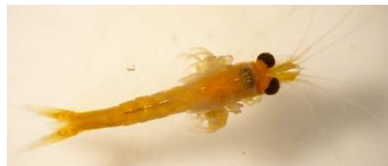
Figure 2. Dorsal view of Hemimysis anomala